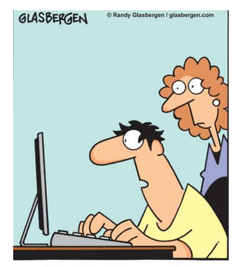
"I'm trying to be more active. Which one burns more calories, Twittering, Blogging or Googling?"

How many products, applications, and tools does Google have? I have no idea. Probably several more than they did a week ago. I think the key is to want to explore and find out. Get into the habit of "Asking Google" anything and you will be amazed.